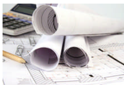
Town of Bethlehem Planning Department resources