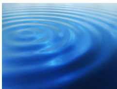
Local Waterfront Revitalization